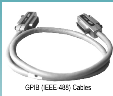
GPIB (IEEE-488) Cables