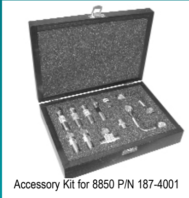
Accessory Kit for 8850 P/N 187-4001