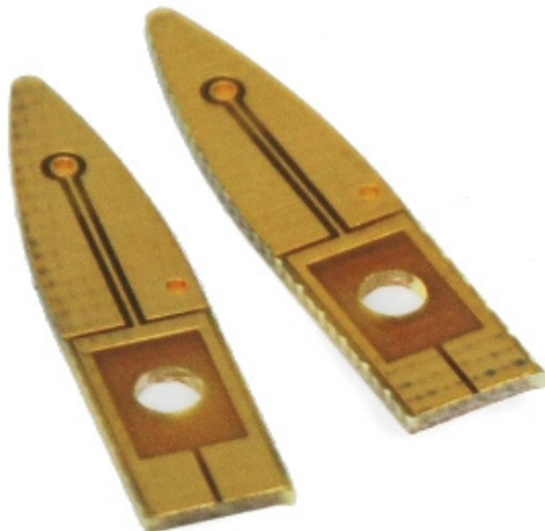
Two wire tips

The two wire tip is suitable for applications where low impedance measurements are not involved. These tips exhibit 20-40 m \Omega of measurement error offset. This is inconsequential to the measurements greater than 1 k \Omega or when measuring typical capacitor values in SMD packages. The value of the two wire tips is greater when grasping small parts. The larger contact area makes it easier for an operator to quickly make contact with less critical alignment.