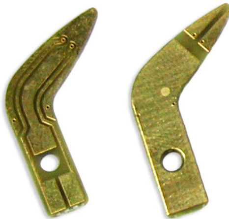
Four wire angled tips

The four wire angled tip is designed for more convenient hand position when testing SMD components. The tip is four wire with a 60° angle, which makes it easier to hold and perform repetitive measurements.