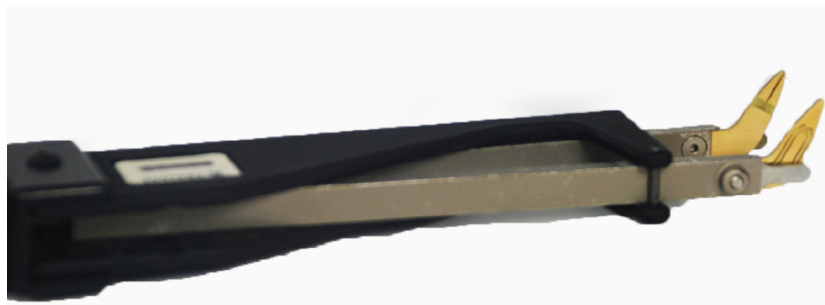
SKT-5 with the four wire angled tips

The variety of tip kits we now offer is as follows: